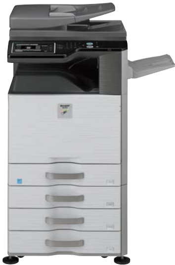
Base Unit Exit Tray Unit Stand with 3 x 500 Sheet Paper Drawers

4. MX-DE20 Stand with 500 + 2000 sheet Paper Drawers