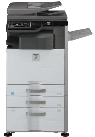
Base Unit Exit Tray Unit Inner Finisher Stand with 500 + 2000 Sheet Paper Drawers