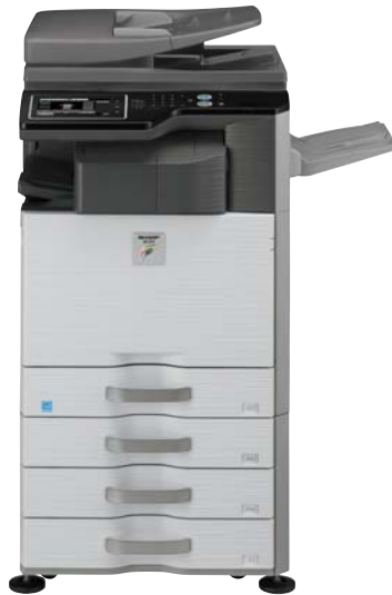
Base Unit Exit Tray Unit Inner Finisher Stand with 3 x 500 Sheet Paper Drawers